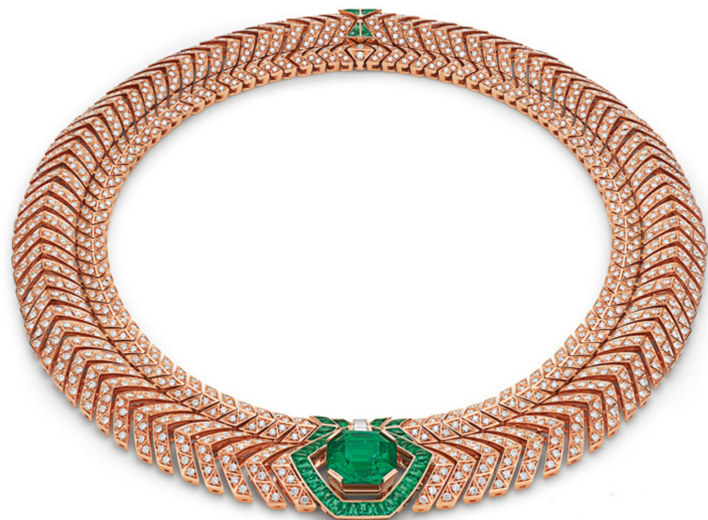
High Jewelry necklace in pink gold with 1 octagonal emerald (Colombia – 12.77 ct), 5 step-cut diamonds (E-G VVS-VS 0.51 ct), 53 buff-top emeralds (3.66 ct), and pavé-set diamonds (D-F IF-VVS 18.85 ct)