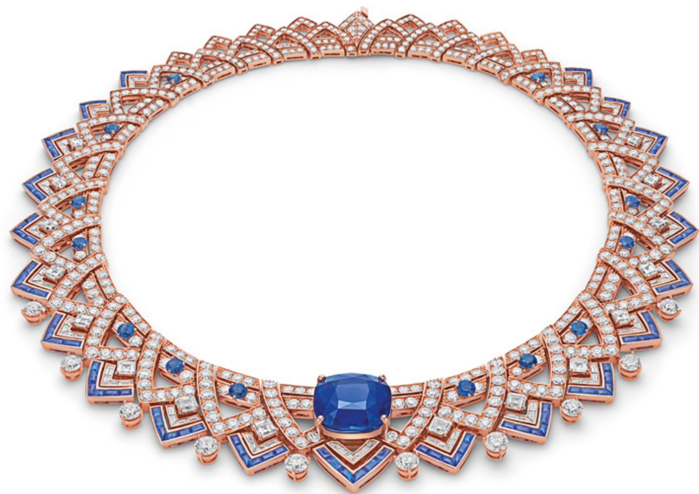
High Jewelry necklace in pink gold with 1 cushion-cut sapphire (Sri Lanka – 26.02 ct), 3 carré diamonds (D-F VVS 1.50 ct), 4 round diamonds (E IF-VVS2 2.00 ct), 6 round diamonds (D-F VVS 2.26 ct), 13 carré diamonds (D-G VVS-VS 3.83 ct), 14 round sapphires (3.80 ct), 98 buff-top sapphires (10.84 ct), 86 step-cut diamonds (D-F VVS-VS 2.69 ct), and pavé-set diamonds (D-F IF-VVS 24.97 ct)