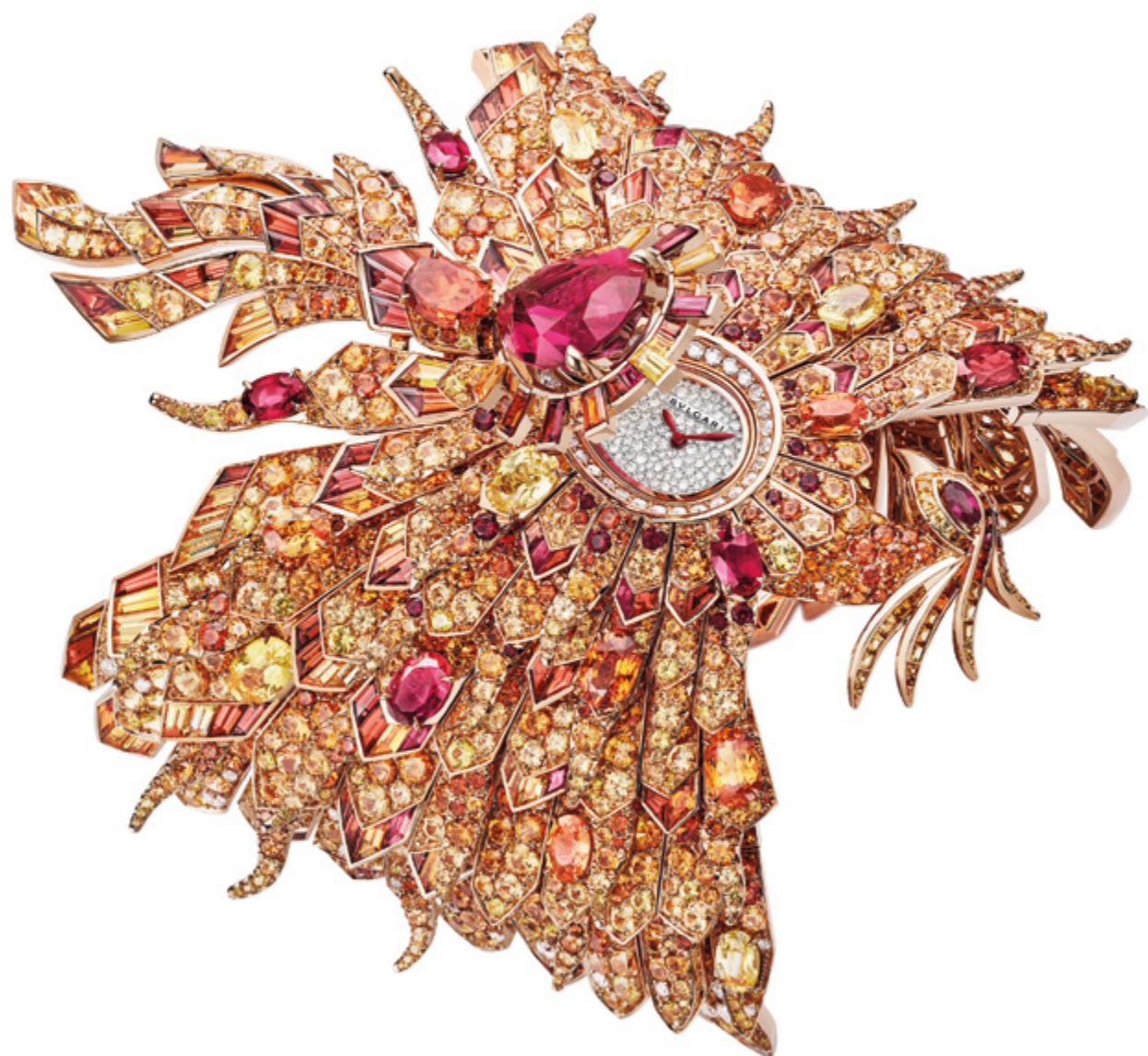
High Jewelry Fenice secret watch in rose gold with 1 pear-shaped rubellite (9.95 ct) as center stone, round mixed mandarin garnets, rubies, and yellow sapphires (108.61 ct), baguette-cut mandarin garnets, rubies, yellow sapphires, citrines, and pyropes (22.51 ct), oval mixed mandarin garnets, rubies, yellow sapphires, and pyropes (18.92 ct), round brilliant-cut diamonds (17.60 ct), baguette-cut diamonds (0.40 ct) and 1 marquise ruby (0.16 ct). Pavé-set diamonds (0.42 ct) on the dial, red hands. Piccolissimo BVL 100 manufacture manual winding mechanical micro movement (2.55-mm thick), 30-hour power reserve, 21,600 VpH (3Hz) frequency.

High Jewelry earrings in platinum with 2 pear-shaped fancy color diamonds (Fancy Orangy Pink IF 4.01 ct; Fancy Intense Yellow VS2 3.00 ct), 2 round diamonds (E VVS2 2.03 ct), 2 pear-shaped diamonds (D-E VS1 2.01 ct), 2 pear-shaped diamonds (D-F VVS 0.81 ct), 4 round diamonds (D-F VVS 1.02 ct), and pavé-set diamonds (D-F IF-VVS 2.56 ct)