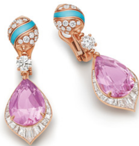
High Jewelry earrings in pink gold with turquoise elements, 2 pear-shaped pink Imperial topazes (10.65 ct; 10.63 ct), 2 round diamonds (F VVS1 0.55 ct; E VVS2 0.51 ct), 34 step-cut diamonds (D-F VVS-VS 2.23 ct), and pavé-set diamonds (D-F IF-VVS 1.72 ct)