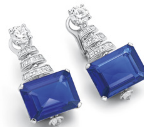
High Jewelry earrings in platinum with 2 octagonal sapphires (Burma – 13.24 ct; Burma – 12.29 ct), 2 round diamonds (E VVS2 1.01 ct; F VVS1 1.01 ct), 2 round diamonds (E-F VVS 0.50 ct), and 30 step-cut diamonds (E-G VVS-VS 1.11 ct)