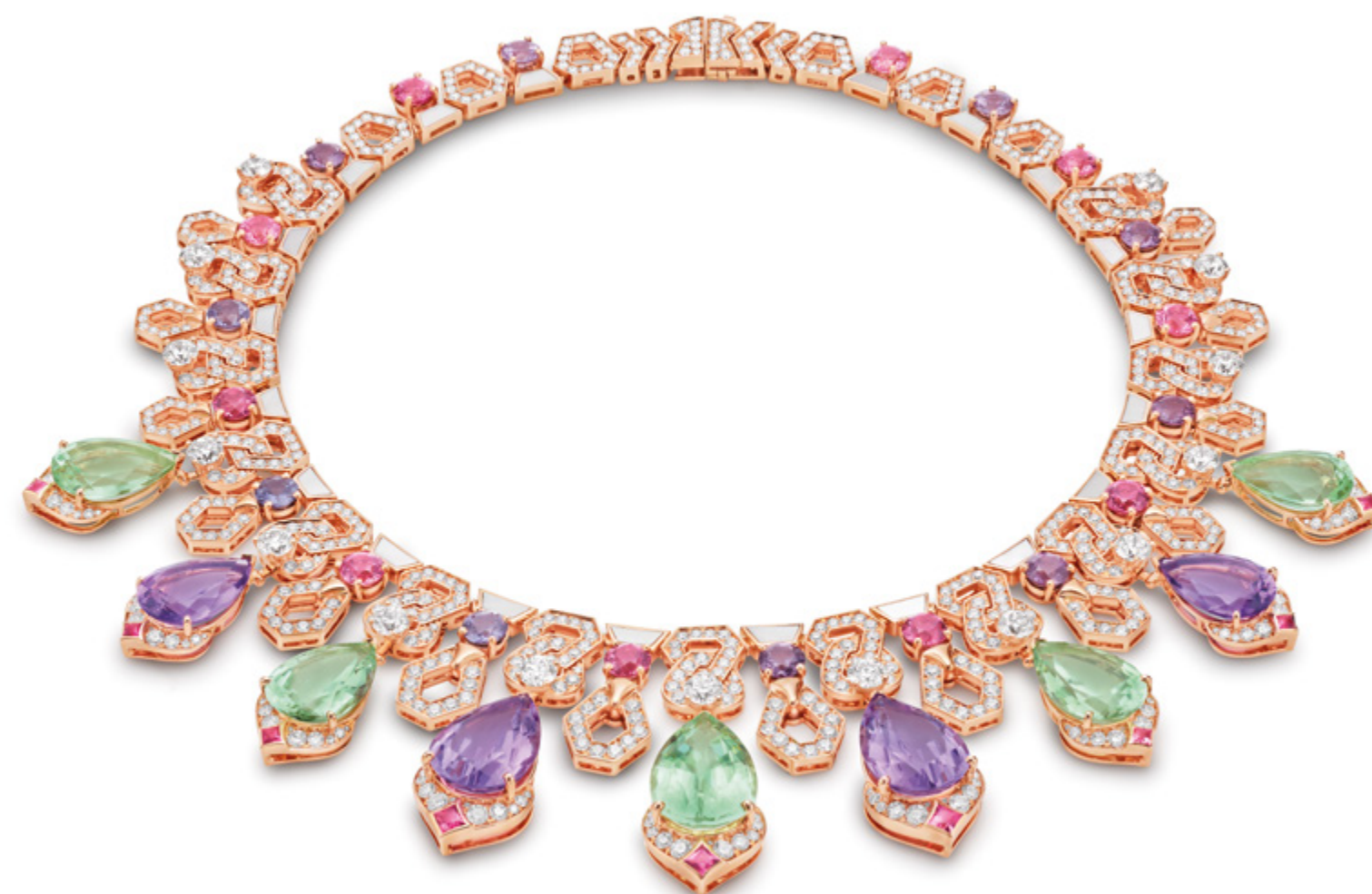
High Jewelry necklace in pink gold set with mother-of-pearl elements and 4 pear-shaped amethysts (34.48 ct), 5 pear-shaped green tourmalines (38.65 ct), 20 round purplish pink-violetish purple spinels (19.59 ct), 2 round brilliant-cut diamonds (E VVS 0.80 ct), 9 buff-top rubellites (0.96 ct), 13 round brilliant-cut diamonds (E-F IF-VVS 6.51 ct), and pavé-set diamonds (D-F IF-VVS 14.15 ct)