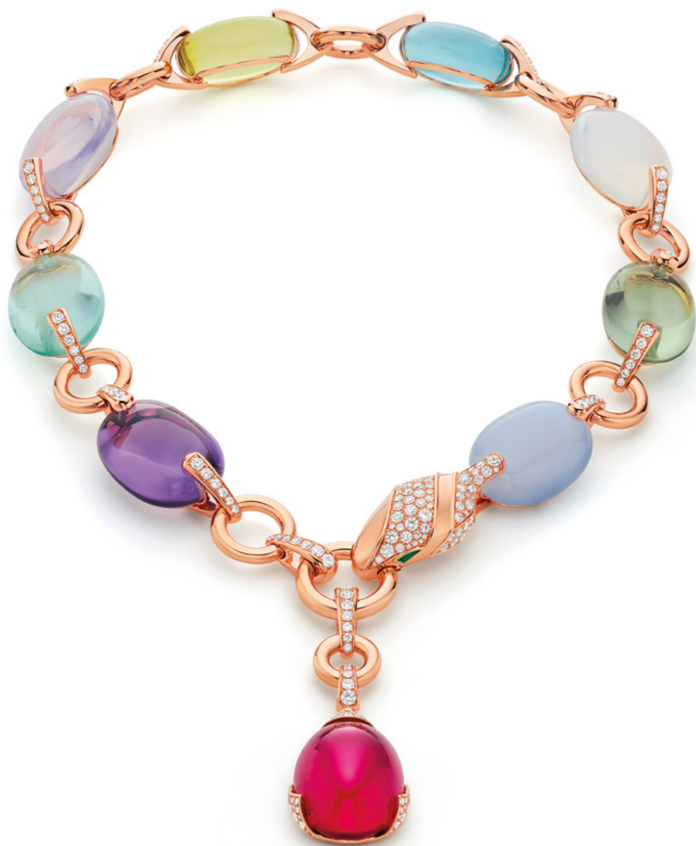
High Jewelry Serpenti necklace in pink gold with 1 fancy polished white quartz (76.00 ct), 2 fancy polished amethysts (145.31 ct), 1 fancy polished chalcedony (63.45 ct), 2 fancy polished yellow and green quartzes (125.97 ct), 2 fancy polished aquamarines (123.83 ct), 1 cabochon rubellite (59.90 ct), 2 fancy shaped emeralds (0.20 ct), and pavé-set diamonds (D-F IF-VVS 8.67 ct)