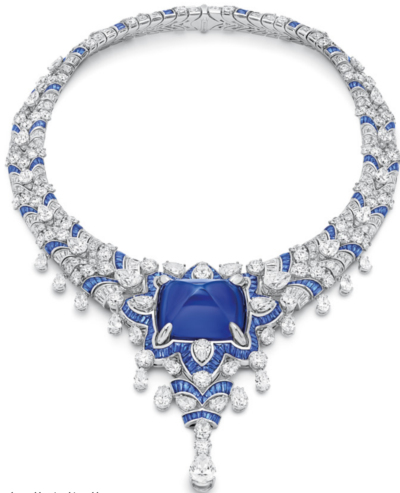
High Jewelry necklace in white gold with 1 sugarloaf sapphire (Sri Lanka, Royal Blue – 123.35 ct), 331 buff-top sapphires (26.91 ct), 30 pear-shaped diamonds (D-F VVS 16.49 ct), 98 round diamonds (D-F VVS 34.79 ct), 14 diamonds (D-F VVS 18.63 ct), 212 step-cut diamonds (E-G VVS-VS 9.50 ct), and pavé-set diamonds (D-F IF-VVS 8.50 ct)