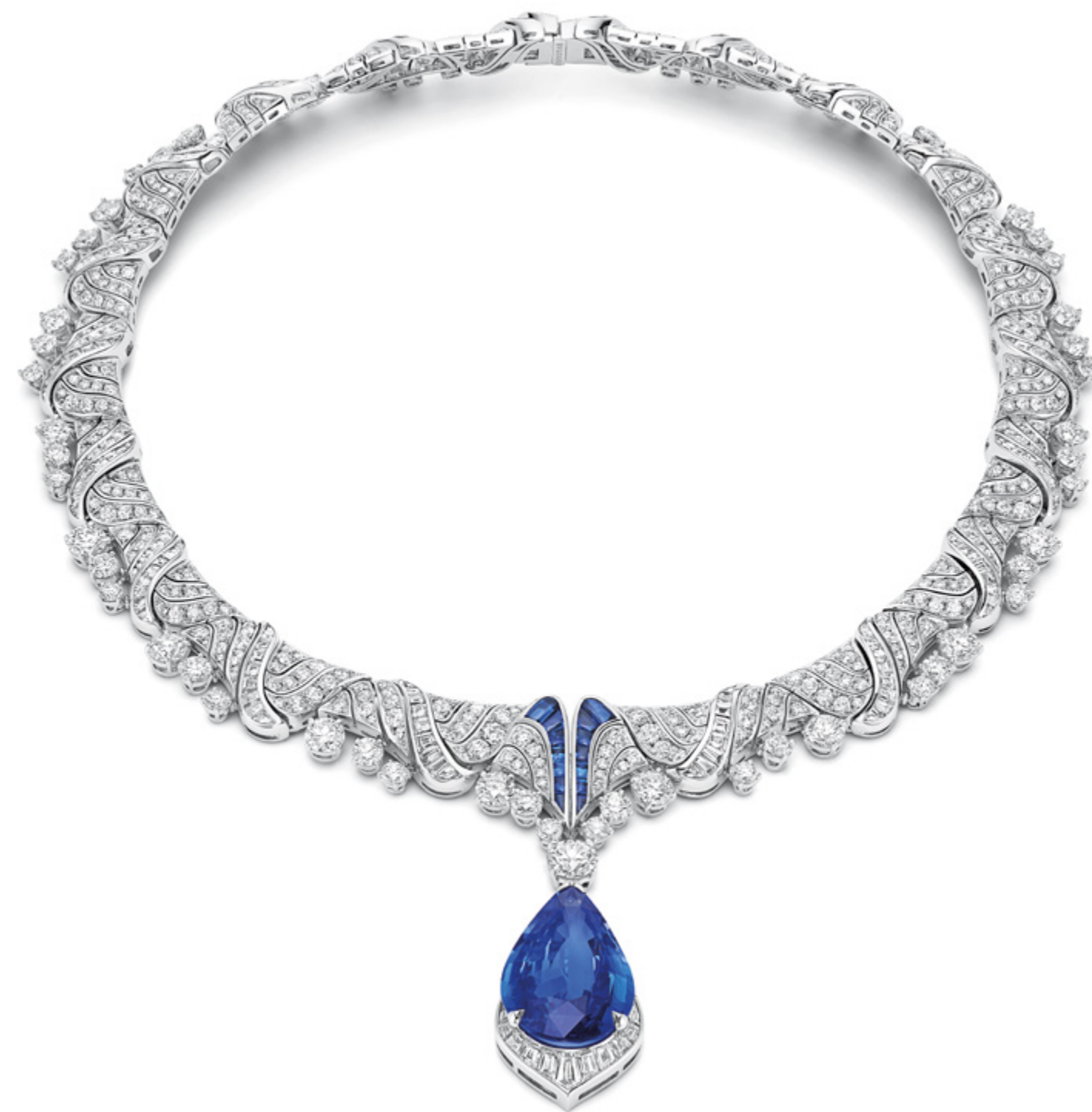
High Jewelry necklace in platinum with 1 pear-shaped sapphire (Sri Lanka – 24.09 ct), 1 round diamond (F VS1 1.01 ct), 8 round diamonds (D-F IF-VVS 4.19 ct), 18 round diamonds (D-F VVS 4.77 ct), 28 buff-top sapphires (2.29 ct), 153 step-cut diamonds (D-F VVS-VS 7.29 ct), and pavé-set diamonds (D-F VVS 15.55 ct)