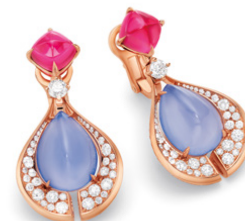
High Jewelry earrings in pink gold with 2 pear-shaped chalcedonies (14.24 ct), 2 cushion-cut rubellites (4.79 ct), 2 round brilliant-cut diamonds (E-F VVS 0.48 ct), and pavé-set diamonds (D-F IF-VVS 2.27 ct)