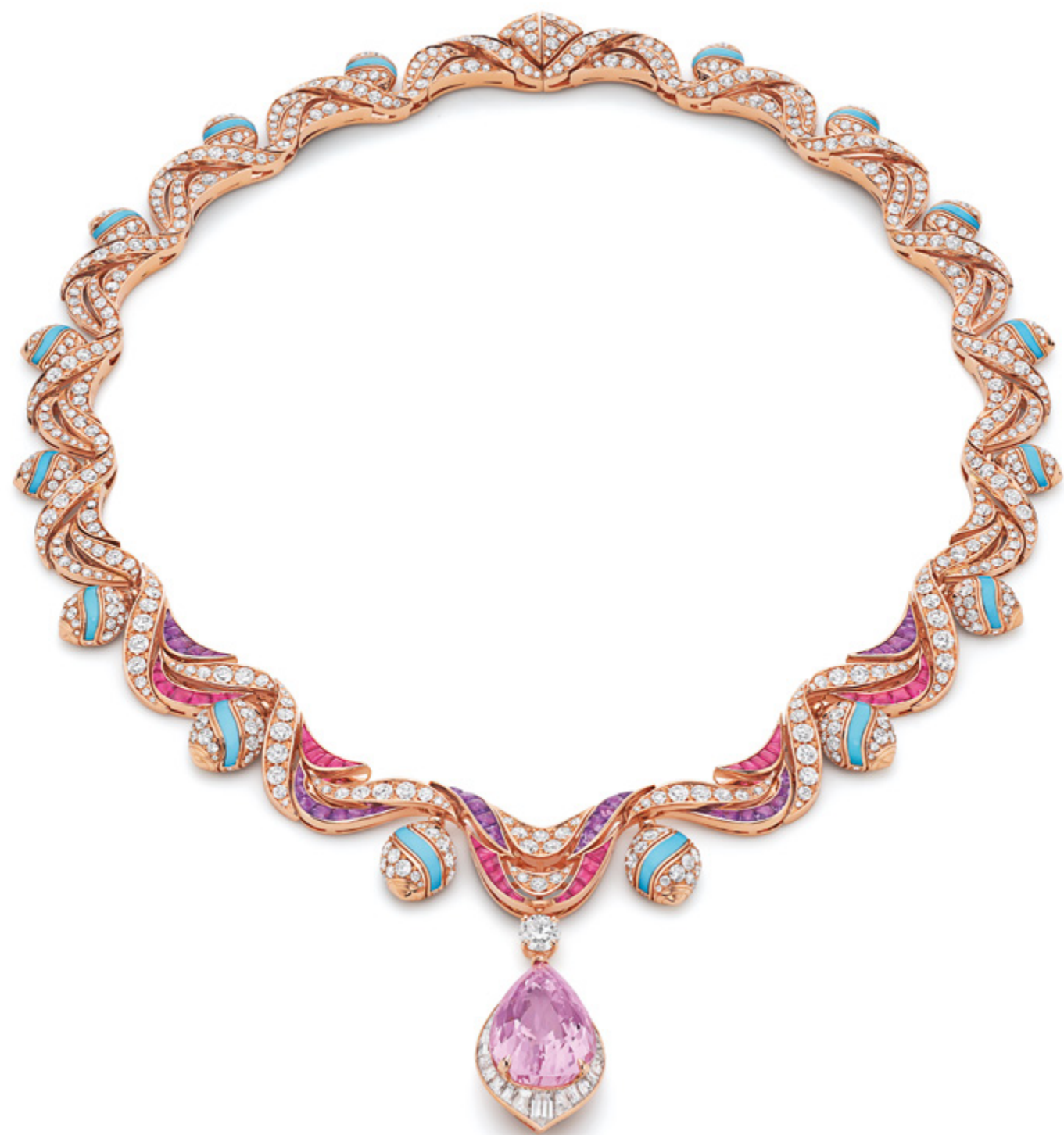
High Jewelry necklace in pink gold with turquoise elements, 1 pear-shaped Imperial topaz (23.19 ct), 1 round diamond (D VVS1 0.70 ct), 19 step-cut diamonds (E-G VVS-VS 1.50 ct), 42 buff-top amethysts (2.36 ct), 38 buff-top rubellites (2.01 ct), and pavé-set diamonds (D-F IF-VVS 19.03 ct)