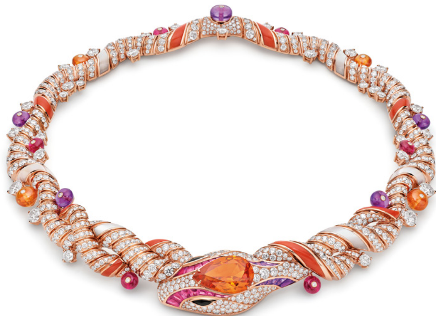
High Jewelry Serpenti necklace in pink gold set with coral and mother-of-pearl elements, 1 pear-shaped mandarin garnet (11.18 ct), 4 round brilliant-cut diamonds (D-E VVS1 2.00 ct), 4 mandarin garnet beads (9.00 ct), 5 amethyst beads (6.65 ct), 6 rubellite beads (5.46 ct), 17 round brilliant-cut diamonds (D-F VVS 4.87 ct), 2 buff-top onyxes (0.25 ct), 14 buff-top pink tourmalines (1.20 ct), 8 buff-top amethysts (0.50 ct), and pavé-set diamonds (D-F IF-VVS 20.46 ct)