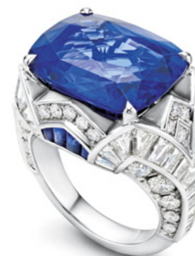
High Jewelry ring in platinum with 1 cushion-cut sapphire (Sri Lanka – 16.68 ct), 40 step-cut diamonds (E-G VVS-VS 3.28 ct), 8 buff-top sapphires (0.46 ct), and pavé-set diamonds (D-F IF-VVS 1.52 ct)