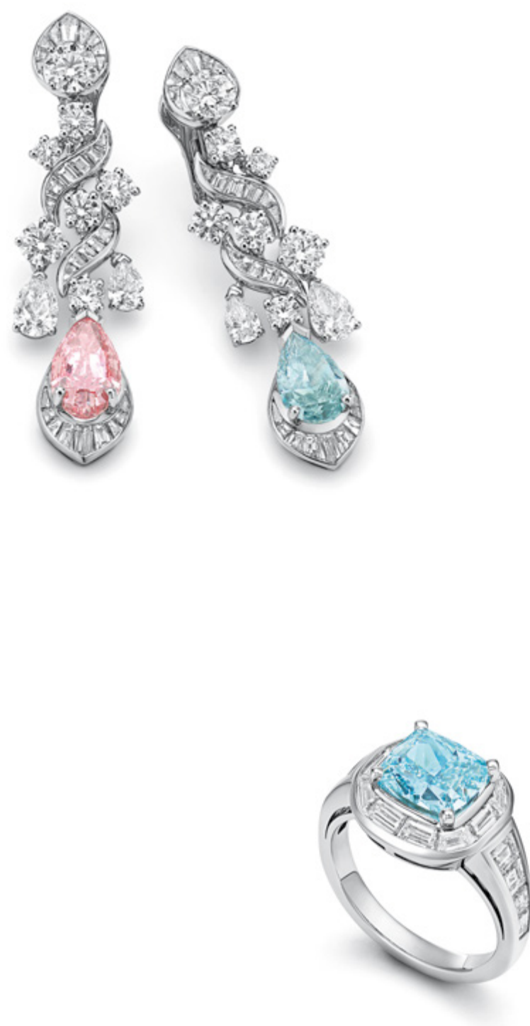
High Jewelry earrings in platinum with 2 fancy color diamonds (Fancy Intense Pinkish Orange VS2 3.97 ct; Fancy Intense Blue IF 2.35 ct), 6 round and pear-shaped diamonds (D-F VVS 3.84 ct), 2 pear-shaped diamonds (D-F VVS 0.69 ct), 10 round brilliant-cut diamonds (D-F VVS 2.21 ct), and 60 step-cut diamonds (E-G VVS-VS 2.65 ct)