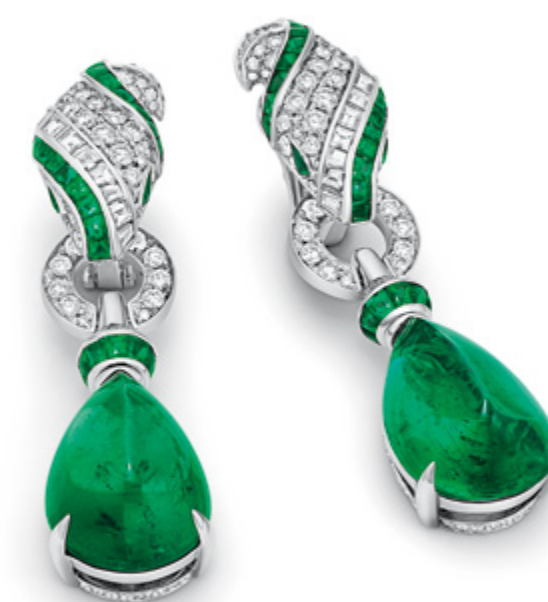
High Jewelry Serpenti earrings in white gold with 2 pear-shaped emeralds (Zambia - 12.94 ct; Zambia - 12.66 ct), 18 step-cut diamonds (D-F VVS-VS 0.78 ct), 50 buff-top emeralds (1.75 ct), and pavé-set diamonds (D-F IF-VVS 1.92 ct)