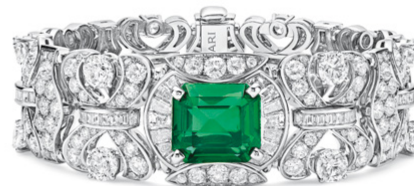
High Jewelry bracelet in white gold and platinum with 1 octagonal emerald (Zambia – 8.37 ct), 8 round diamonds (D-F VVS1 4.01 ct), 8 round diamonds (D-F VVS 2.66 ct), 50 step-cut diamonds (E-G VVS-VS 2.34 ct), and pavé- set diamonds (D-F IF-VVS 9.60 ct)