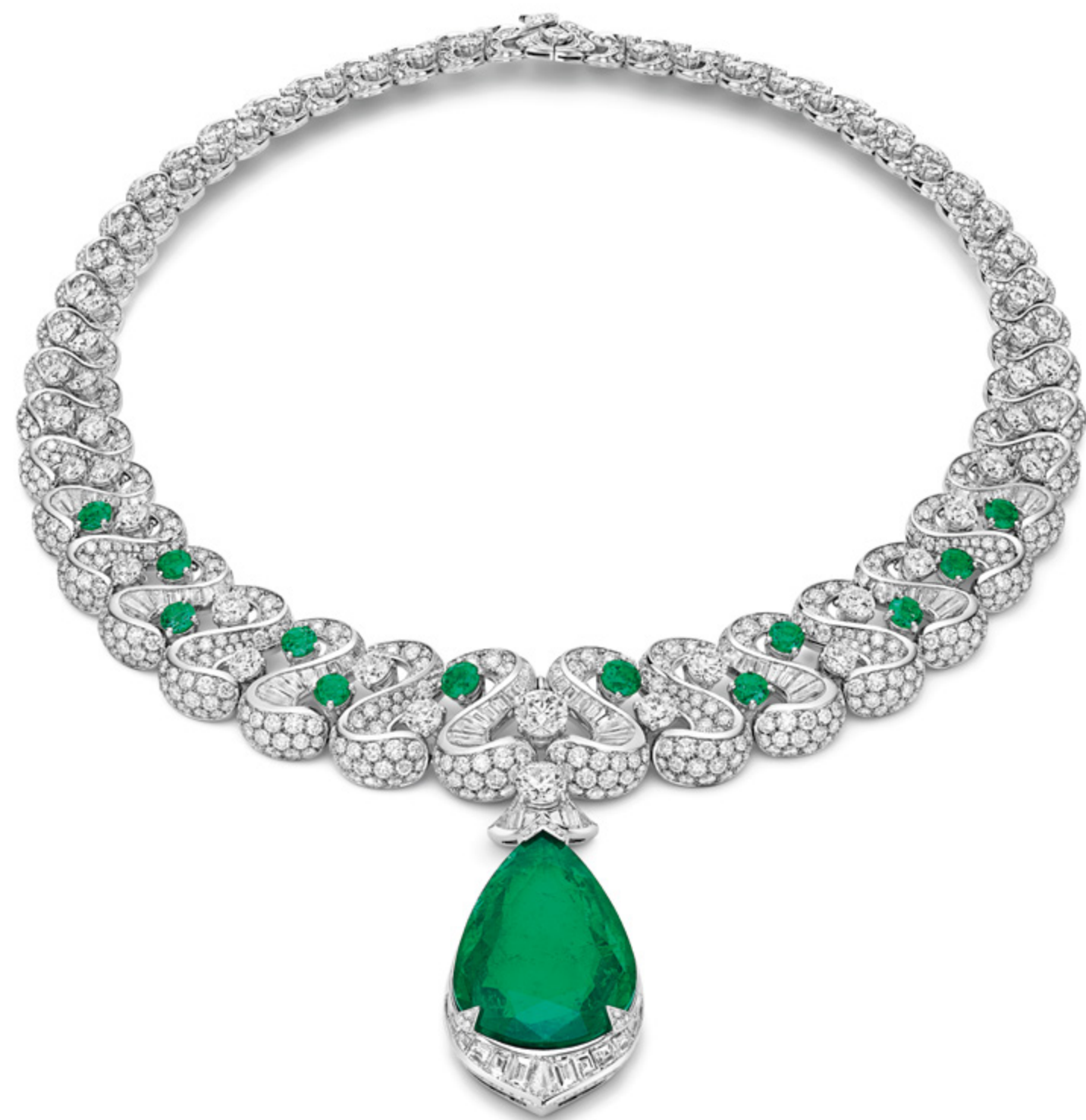
High Jewelry necklace in platinum with 1 drop emerald (Colombia – 51.10 ct), 2 round diamonds (G VS2 2.70 ct), 12 round emeralds (5.48 ct), 20 round diamonds (D-F VVS 7.42 ct), 107 step-cut diamonds (E-G VVS-VS 8.66 ct), and pavé-set diamonds (D-F IF-VVS 32.64 ct)