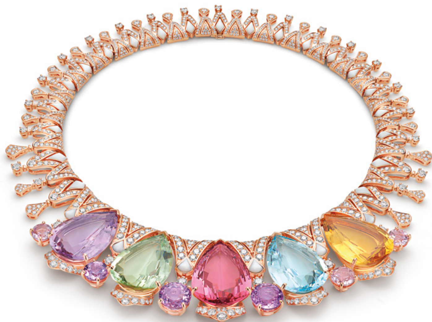
High Jewelry necklace in pink gold set with mother-of-pearl elements and 1 pear-shaped morganite (32.96 ct), 1 pear-shaped citrine quartz (32.85 ct), 1 pear-shaped green quartz (32.54 ct), 1 pear-shaped aquamarine (32.15 ct), 1 pear-shaped amethyst (30.88 ct), 6 round kunzites (21.07 ct), 6 round diamonds (D-F VVS 1.23 ct), and pavé-set diamonds (D-F IF-VVS 19.38 ct)