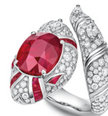
High Jewelry Serpenti ring in platinum with 1 cushion-cut ruby (Mozambique – 6.03 ct), 3 marquise diamonds (D-F VVS-VS 0.36 ct), 20 buff-top rubies (0.77 ct), and pavé-set diamonds (D-F IF-VVS 2.44 ct)