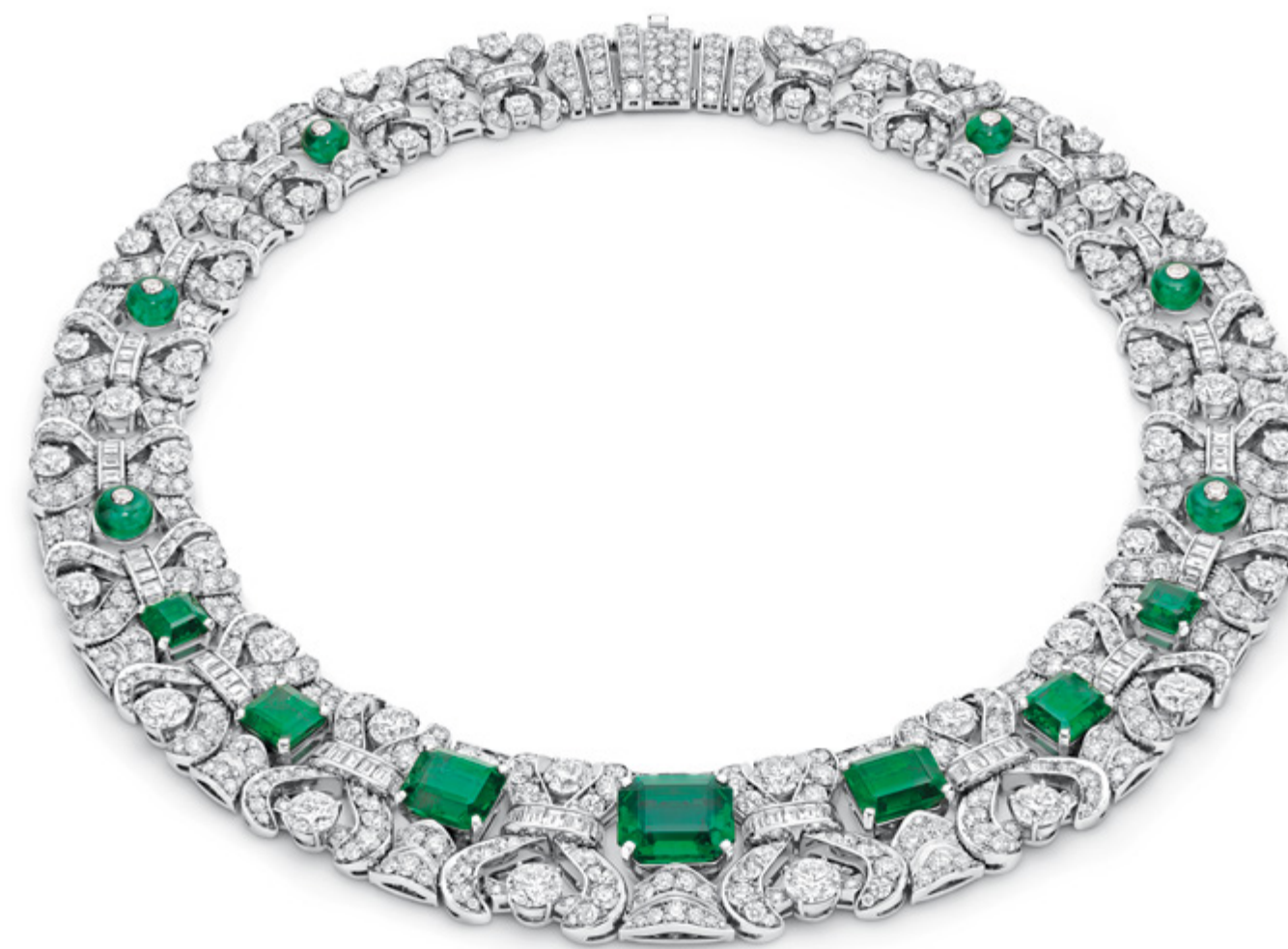
High Jewelry necklace in platinum with 7 octagonal emeralds (Zambia – 28.38 ct), 24 round diamonds (D-F IF-VS 16.33 ct), 6 emerald beads (10.86 ct), 16 round diamonds (D-F VVS 5.31 ct), 128 step-cut diamonds (E-G VVS-VS 790 ct), and pavé-set diamonds (D-F IF-VVS 1.27 ct)