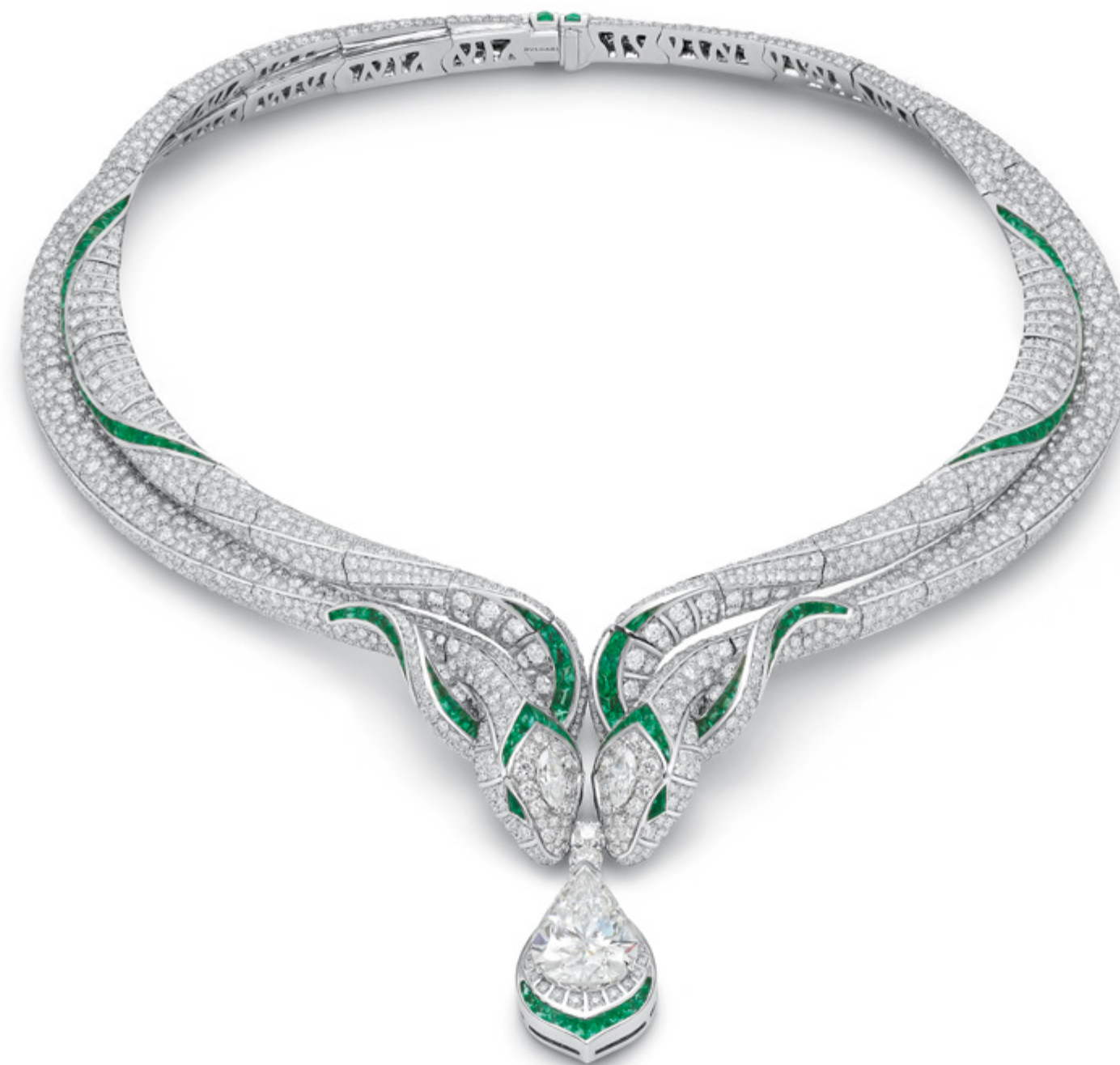
High Jewelry Serpenti necklace in white gold with 1 pear-shaped diamond (D VS2 10.03 ct), 2 marquise diamonds (D-E VVS 0.66 ct), 144 buff-top emeralds (6.43 ct), and pavé-set diamonds (D-F IF-VVS 36.37 ct)