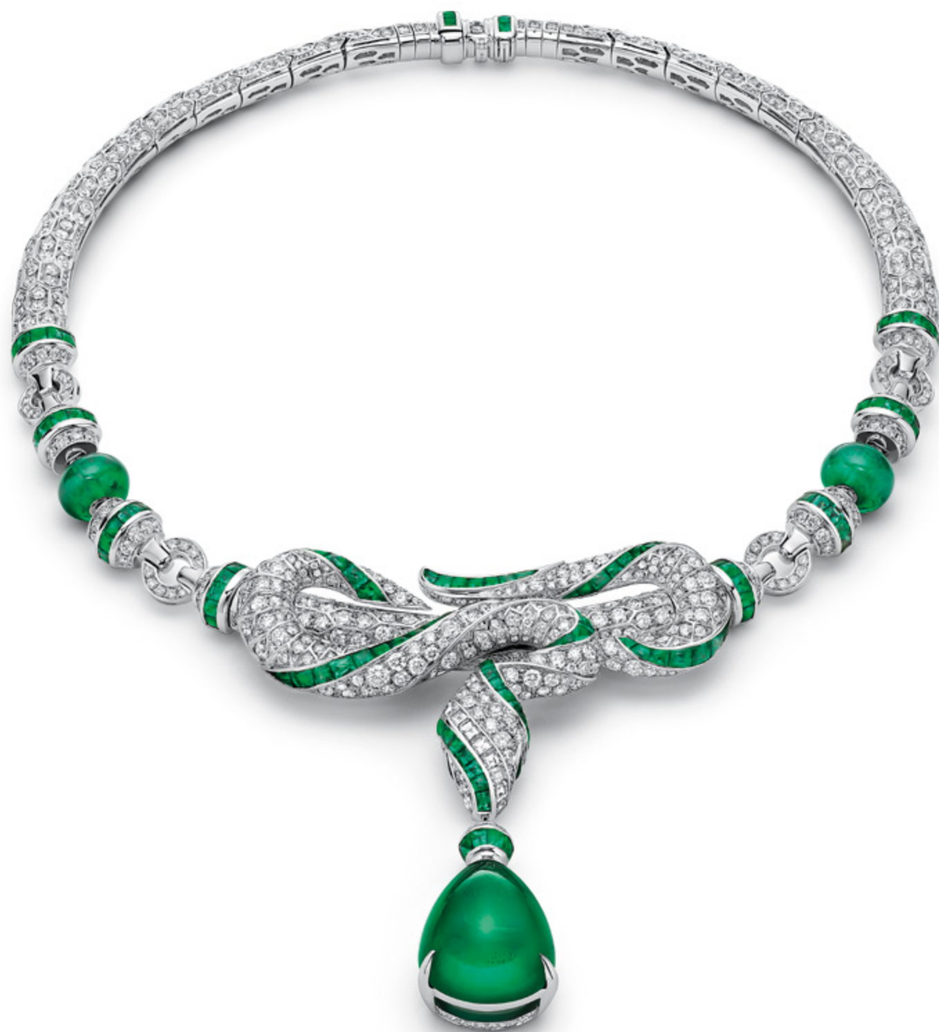
High Jewelry Serpenti detachable necklace in white gold, with an additional yellow gold support, 1 pear-shaped cabochon emerald (Zambia - 28.70 ct), 2 emerald beads (13.19 ct), 9 step-cut diamonds (D-F VVS-VS 0.80 ct), 135 buff-top emeralds (10.18 ct), and pavé-set diamonds (D-F IF-VVS 22.27 ct)