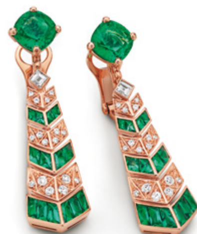
High Jewelry earrings in pink gold with 2 cushion-cut emeralds (3.52 ct), 2 carré diamonds (D-F VVS-VS 0.27 ct), 28 buff-top emeralds (2.42 ct), and pavé-set diamonds (D-F IF-VVS 0.43 ct)