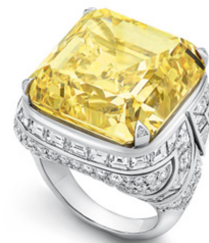
High Jewelry ring in platinum with 1 Asscher-cut fancy color diamond (Vivid Yellow VS1 45.07 ct), 42 step-cut diamonds (E-G VVS-VS 5.08 ct), and pavé-set diamonds (D-F IF-VVS 1.86 ct)