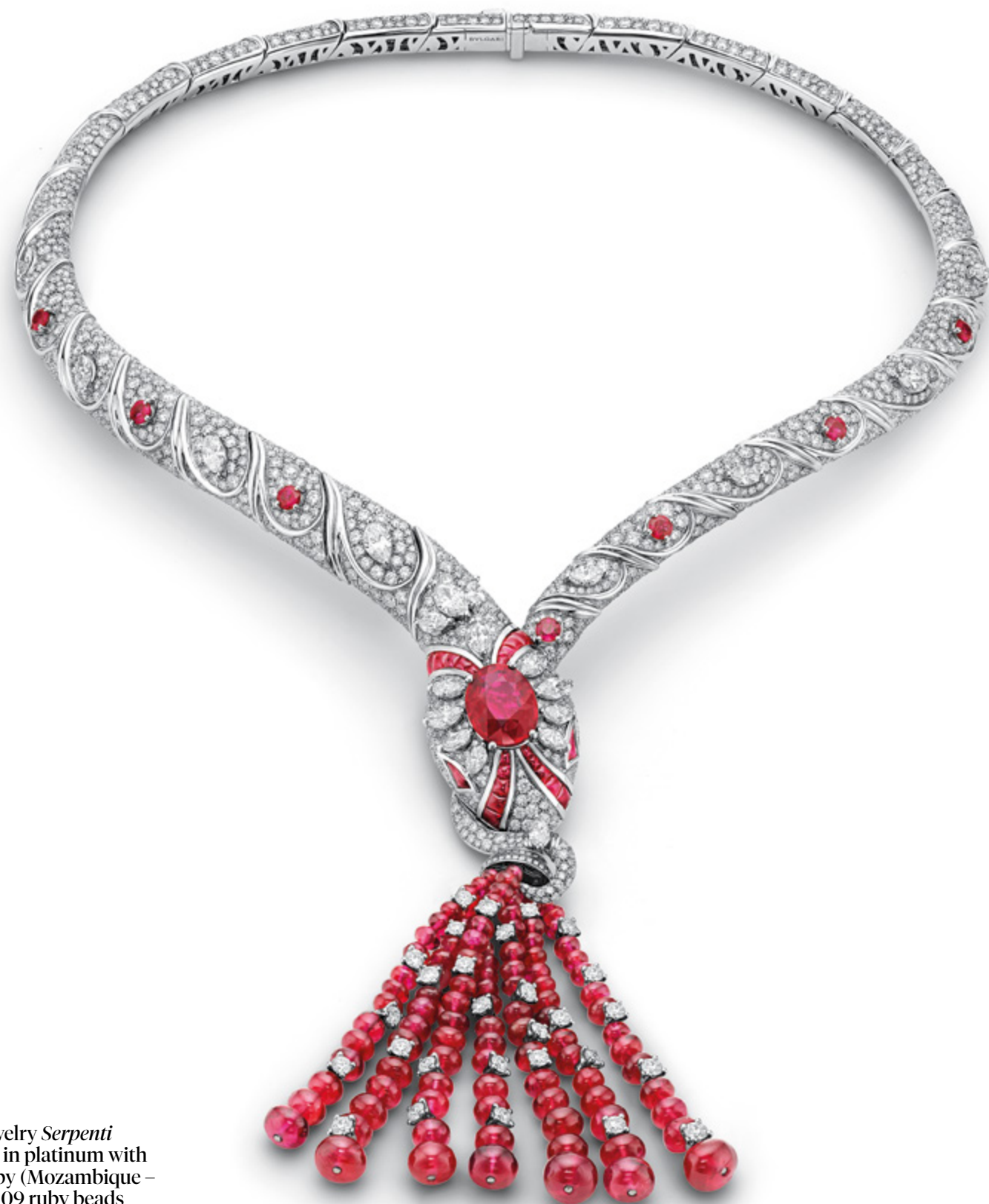
High Jewelry Serpenti necklace in platinum with 1 oval ruby (Mozambique – 5.02 ct), 109 ruby beads (68.45 ct), 7 round rubies (1.41 ct), 21 marquise diamonds (D-F VVS 3.64 ct), 22 buff-top rubies (2.34 ct), and pavé-set diamonds (D-F IF-VVS 24.92 ct)