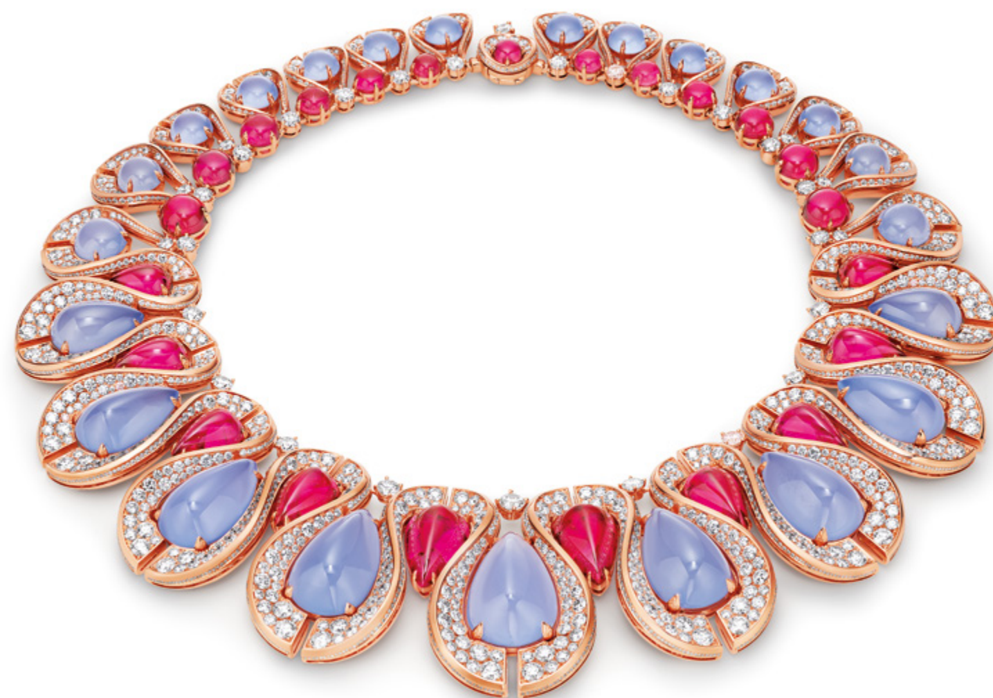
High Jewelry necklace in pink gold with 9 cabochon blue chalcedonies (114.59 ct), 10 cabochon rubellites (58.53 ct), 14 cabochon round chalcedonies (34.98 ct), 13 cabochon round rubellites (26.45 ct), and pavé-set diamonds (D-F IF-VVS 41.56 ct)