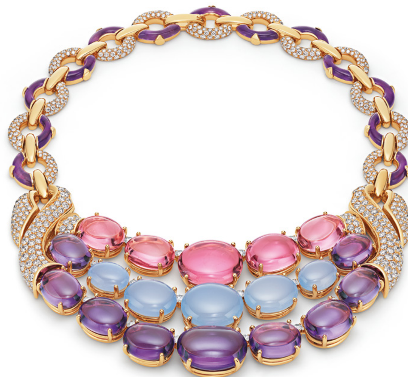
High Jewelry necklace in yellow gold with 5 cabochon pink tourmalines (126.80 ct), 5 cabochon chalcidones (90.52 ct), 9 cabochon amethysts (159.75 ct), 13 fancy polished amethysts (31.22 ct), 16 round brilliant-cut diamonds (D-F VVS 3.96 ct), and pavé-set diamonds (D-F IF-VVS 28.10 ct)