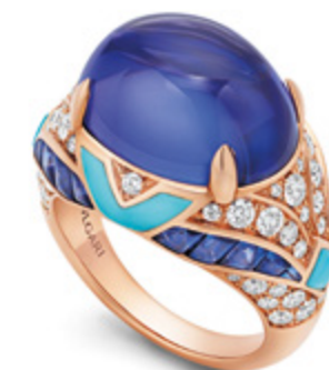
High Jewelry ring in pink gold with turquoise elements, 1 oval cabochon tanzanite (13.81 ct), 20 buff-top sapphires (1.64 ct), and pavé-set diamonds (D-F IF-VVS 1.08 ct)