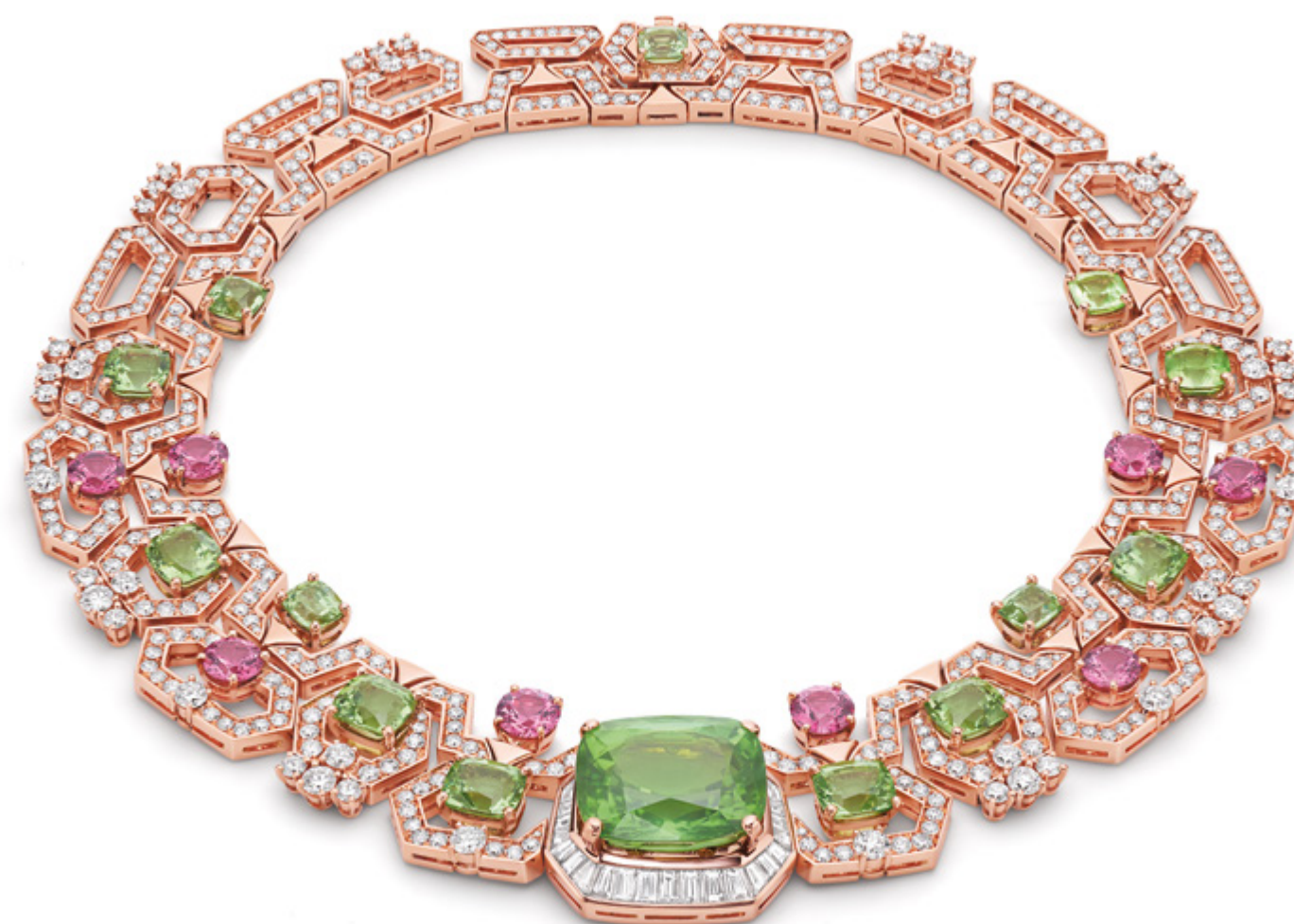
High Jewelry necklace in pink gold with 1 cushion-cut peridot (38.95 ct), 13 cushion-cut peridots, 8 Malaya garnets (12.61 ct), 12 round diamonds (D-F VVS 3.60 ct), 21 step-cut diamonds (E-G VVS-VS 2.46 ct), and pavé-set diamonds (D-F IF-VVS 23.15 ct)