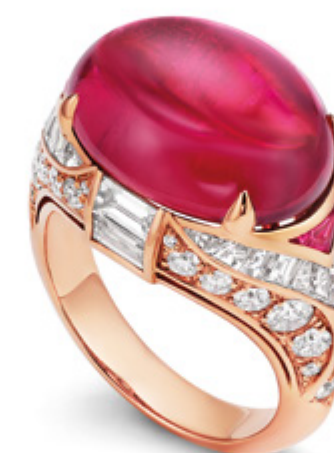
High Jewelry ring in pink gold with 1 oval cabochon rubellite (12.02 ct), 2 buff-top rubellites (0.19 ct), 28 step-cut diamonds (D-F VVS-VS 1.44 ct), and pavé-set diamonds (D-F IF-VVS 1.05 ct)