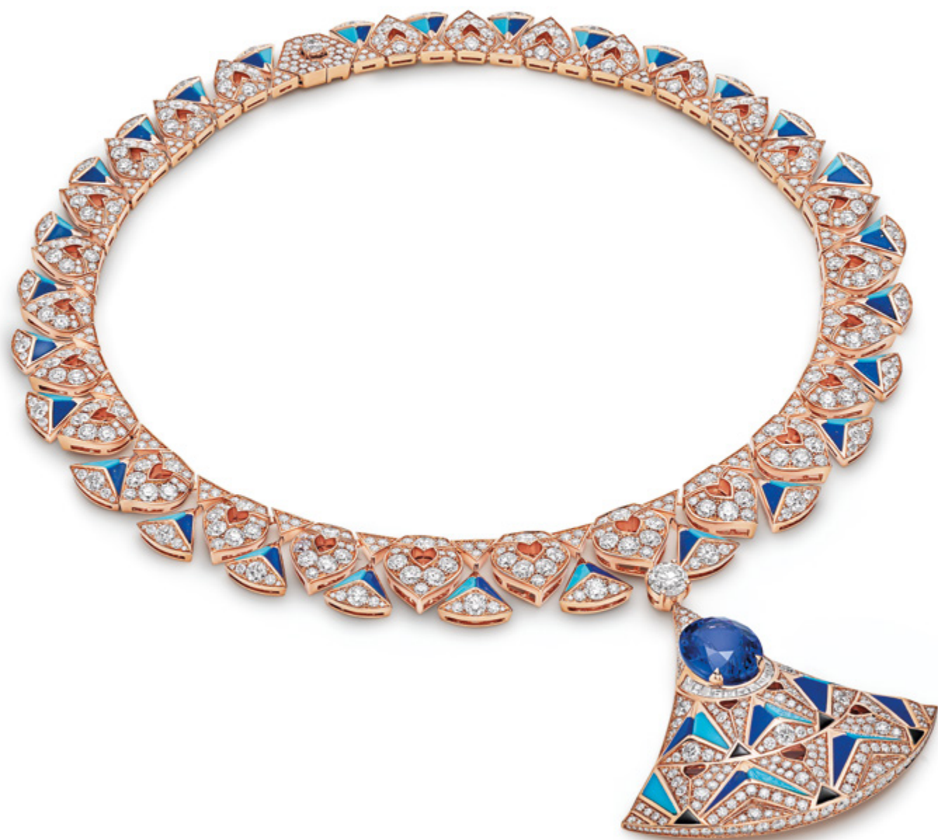
High Jewelry Divas' Dream necklace in pink gold with lapis lazuli, turquoise, and onyx elements, 1 round diamond (F VS1 1.01 ct), 1 oval tanzanite (11.63 ct), 12 step-cut diamonds (F-G VVS-VS 0.44 ct), and pavé-set diamonds (D-F VVS 30.77 ct)