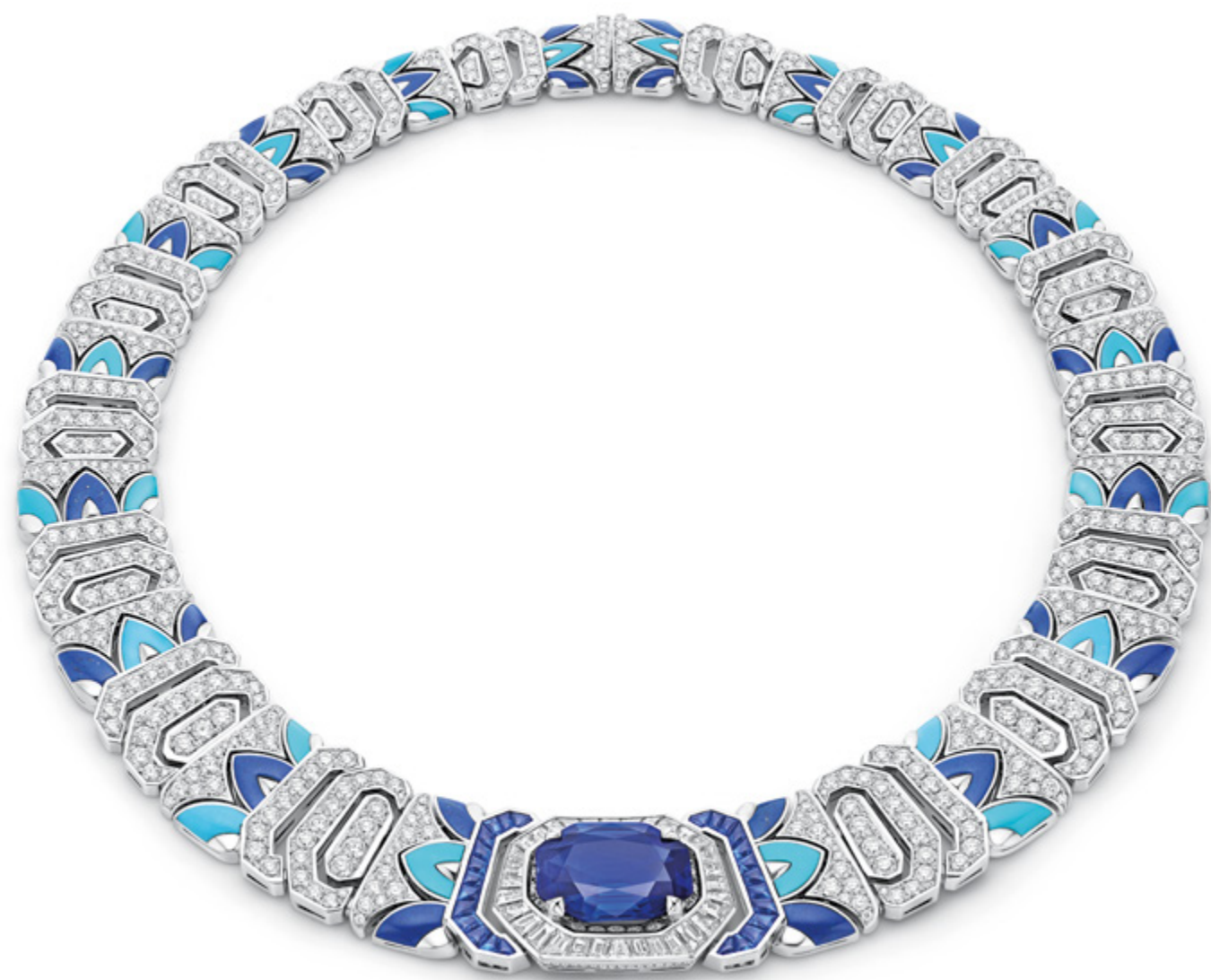
High Jewelry necklace in platinum with turquoise and lapis lazuli elements, 1 octagonal sapphire (Sri Lanka, Royal Blue – 20.05 ct), 32 step-cut diamonds (E-G VVS-VS 3.66 ct), 26 buff-top sapphires (2.81 ct), and pavé-set diamonds (D-F IF-VVS 22.21 ct)