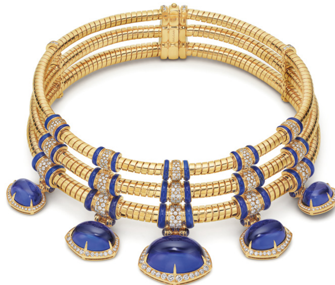
High Jewelry Tubogas necklace in yellow gold with lapis lazuli elements, 5 cabochon tanzanites (104.69 ct), 11 buff-top sapphires (2.23 ct), and pavé-set diamonds (D-F IF-VVS 11.20 ct)