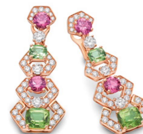
High Jewelry earrings in pink gold with 4 cushion-cut peridots (8.61 ct), 4 round Malaya garnets (4.73 ct), 2 round diamonds (D-F VVS 0.82 ct), and pavé-set diamonds (D-F VVS 4.10 ct)