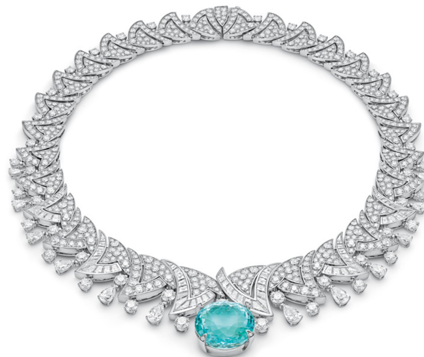
High Jewelry necklace in platinum with 1 oval Paraiba tourmaline (Mozambique – 31.46 ct), 12 pear-shaped diamonds (D-F VVS 5.64 ct), 21 round diamonds (D-F VVS 6.95 ct), 72 step-cut diamonds (E-G VVS-VS 9.14 ct), and pavé-set diamonds (D-F IF-VVS 27.37 ct)