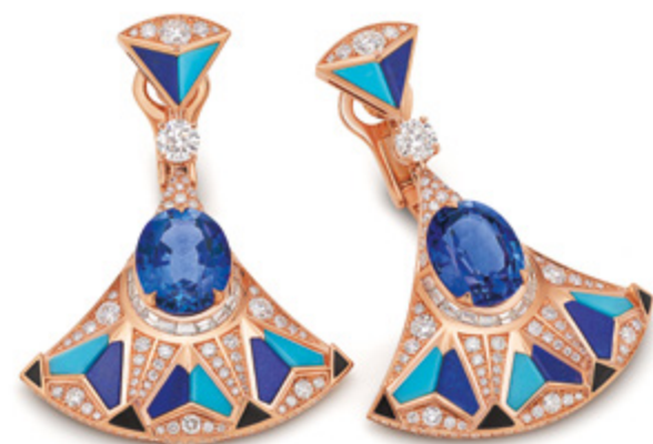
High Jewelry Divas' Dream earrings in pink gold with lapis lazuli, onyx, and turquoise elements, 2 oval tanzanites (9.09 ct), 2 round diamonds (D-F VVS 0.62 ct), 22 fancy-cut diamonds (E-G VVS-VS 0.40 ct), and pavé-set diamonds (D-F IF-VVS 1.85 ct)