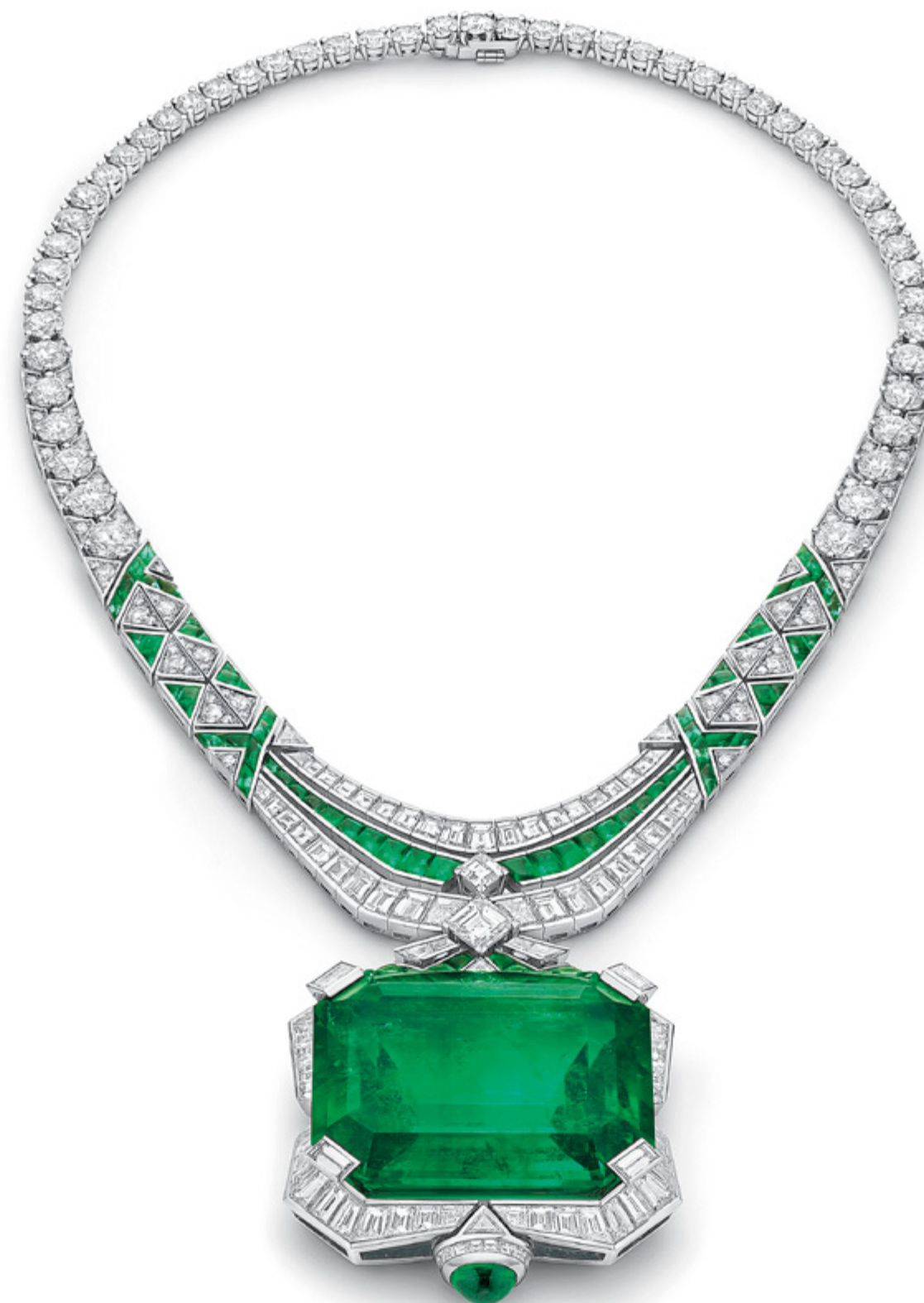
High Jewelry necklace in platinum with 1 octagonal emerald (Colombia – 241.04 ct), carré diamonds, buff-top emeralds, round diamonds, and pavé-set diamonds