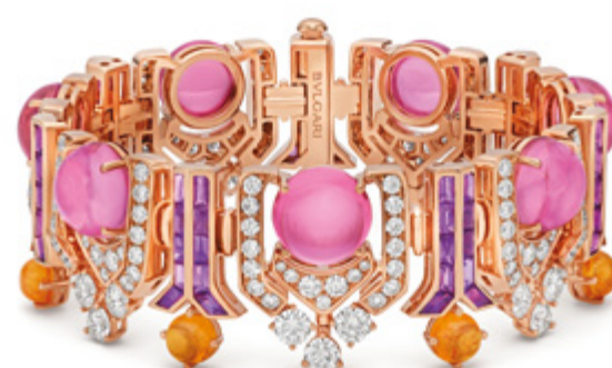
High Jewelry necklace in pink gold with 9 cabochon mandarin garnets (58.34 ct), 9 cabochon pink tourmalines (46.72 ct), 1 round pink tourmaline (0.41 ct), 53 round brilliant-cut diamonds (D-F VVS 16.48 ct), 204 buff-top amethysts (13.60 ct), and pavé-set diamonds (D-F IF-VVS 11.19 ct)