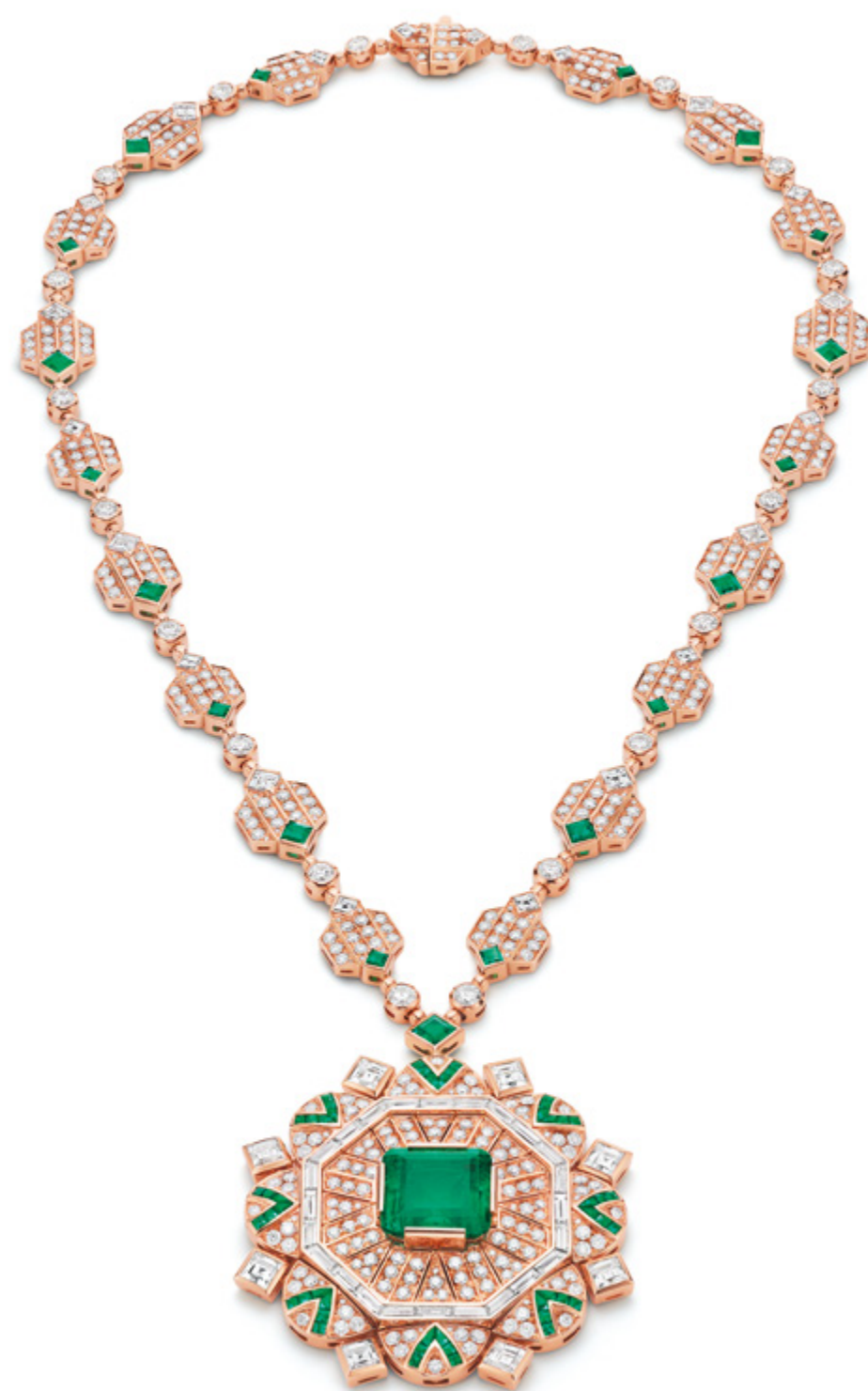
High Jewelry necklace, detachable in a bracelet and a brooch, in pink gold with 1 cushion-cut emerald (Colombia – 11.92 ct), 33 carré diamonds (D-F VVS-VS 11.29 ct), 24 carré emeralds (6.33 ct), 26 round diamonds (D-F VVS 6.46 ct), 24 baguette-cut diamonds (D-F VVS-VS 3.01 ct), 56 buff-top emeralds (1.61 ct), and pavé-set diamonds (D-F IF-VVS 15.71 ct)