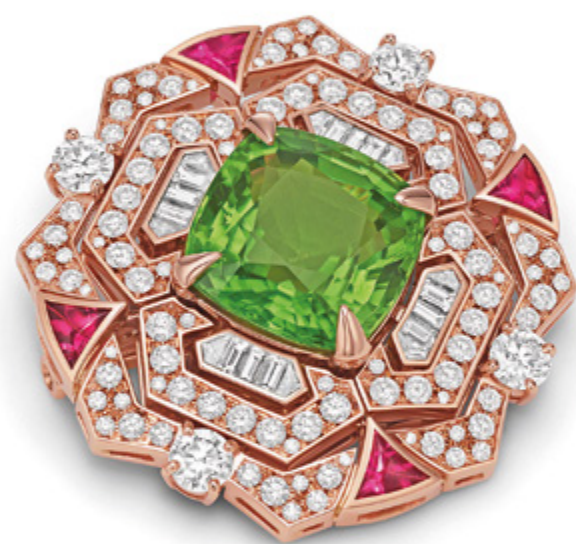
High Jewelry brooch in pink gold with 1 cushion-cut peridot (15.34 ct), 4 round diamonds (D-E VVS 1.23 ct), 4 buff-top rubellites (0.95 ct), 20 step-cut diamonds (D-F VVS-VS 0.78 ct), and pavé-set diamonds (D-F IF-VVS 1.93 ct)