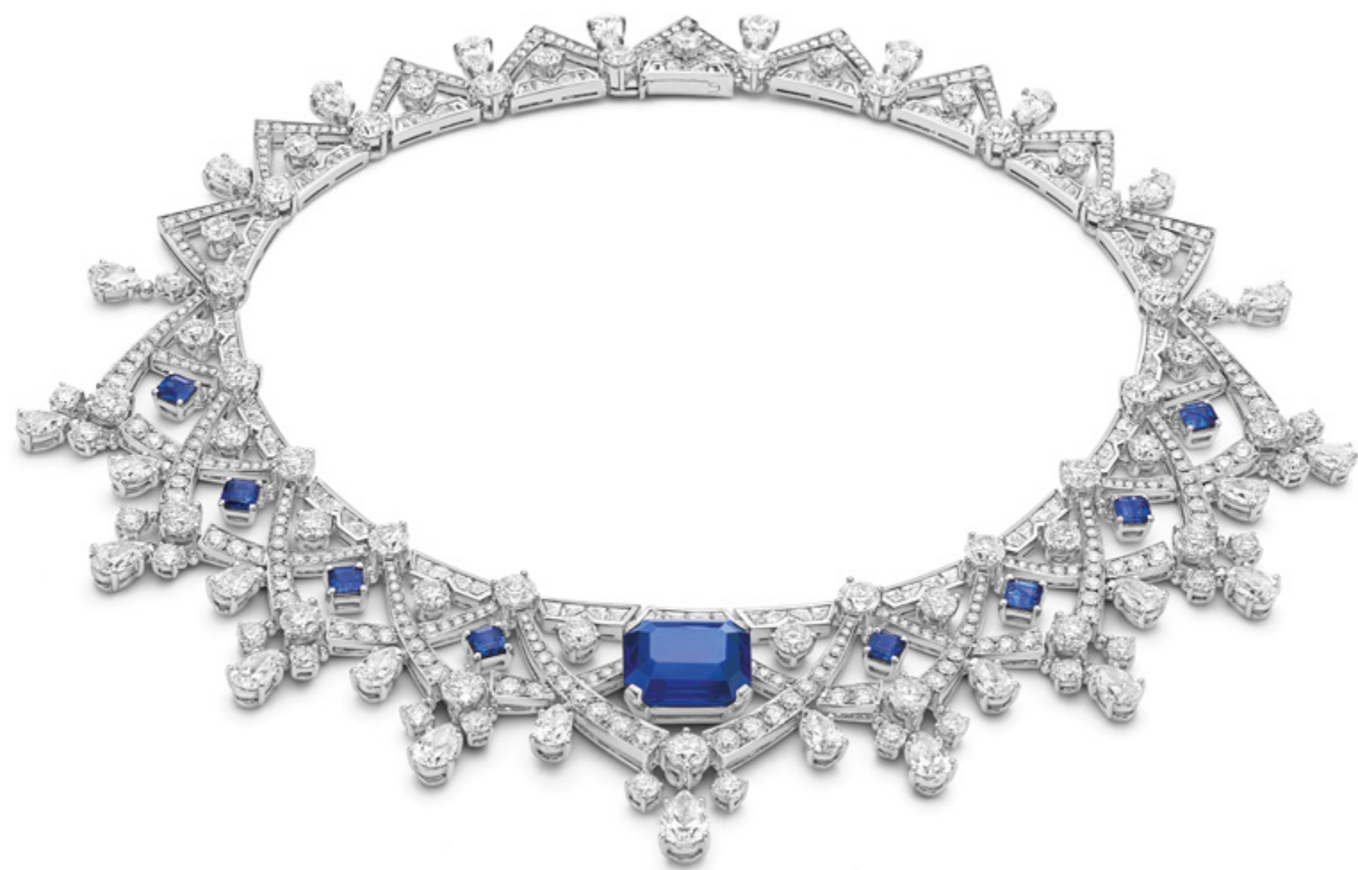
High Jewelry necklace in platinum with 1 octagonal sapphire (Madagascar – 23.59 ct), 27 pear-shaped diamonds (D-F IF-VVS 21.77 ct), 46 round diamonds (D-F IF-VVS 29.01 ct), 8 Asscher-cut sapphires (5.81 ct), 80 step-cut diamonds (E-G VVS-VS 9.80 ct), and pavé-set diamonds (E-F VVS 15.98 ct)